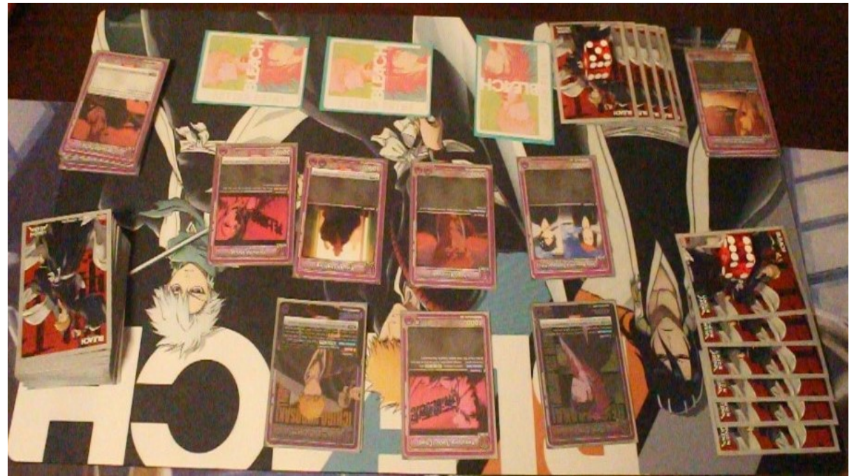
This is another example of a correct layout. This setup utilizes dice to keep track of hand and life count. This is not required but suggested for online play