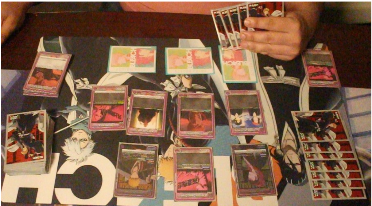
The layout matches the approved layout in the official rule manual. The hand is in the picture but secret to the opponent.